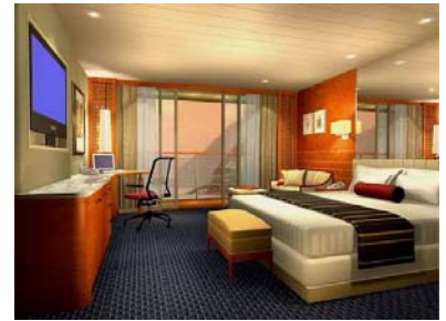
38 Deluxe Cabins (290 sq. ft)