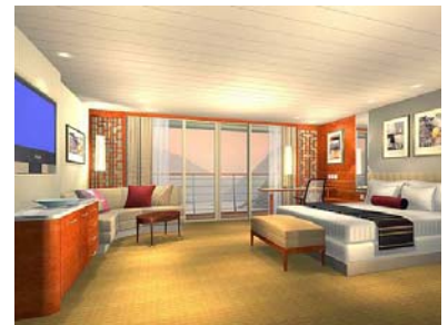
20 Suites (397 sq ft)